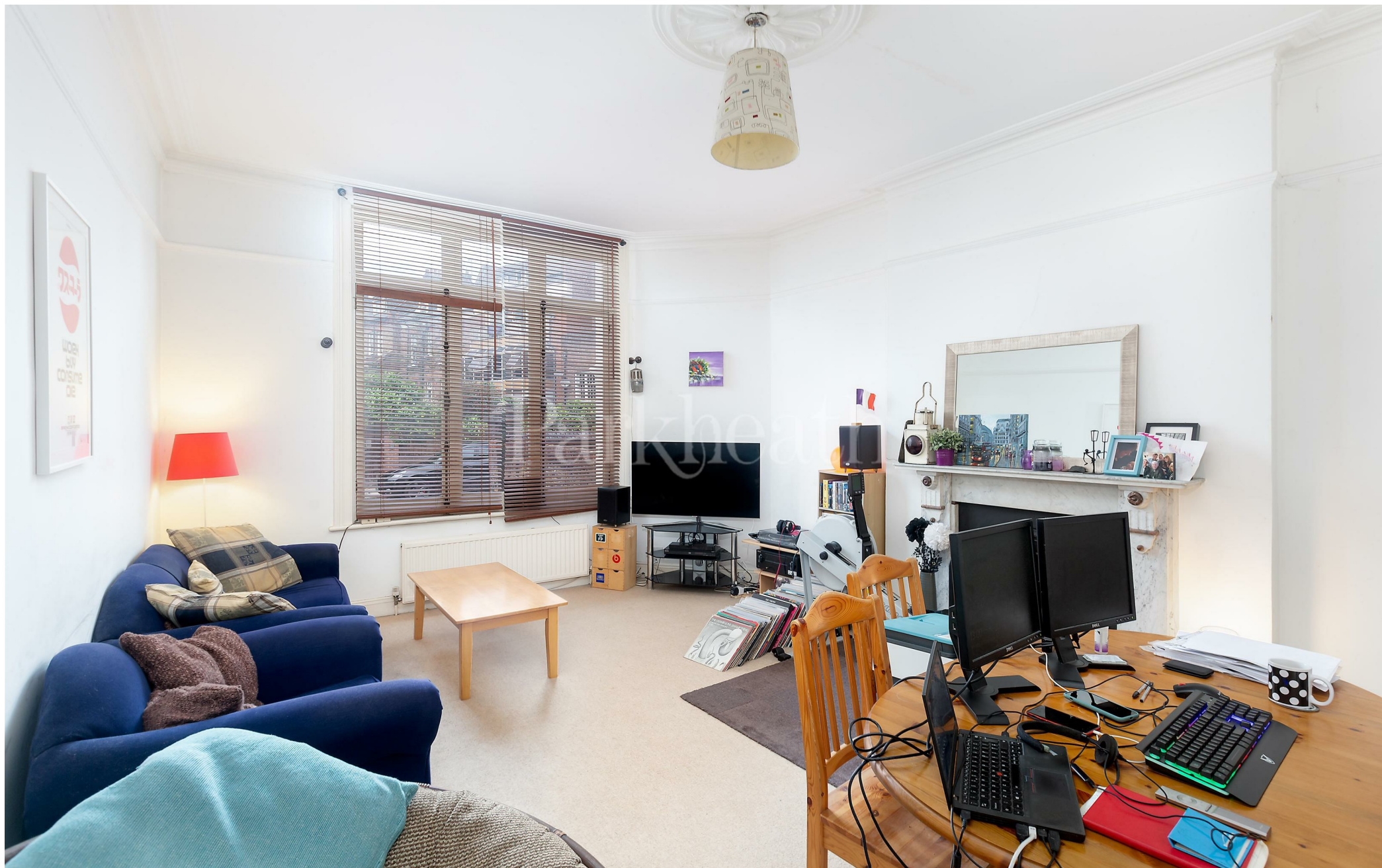
Canfield Gardens NW6